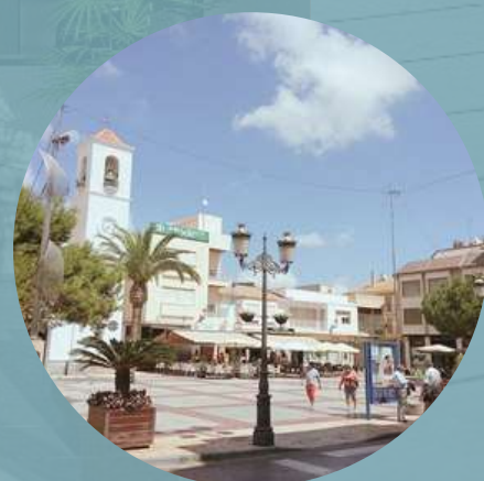
ALL SERVICES NEARBY