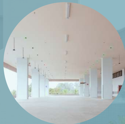
GARAGE AND STORAGE ROOM