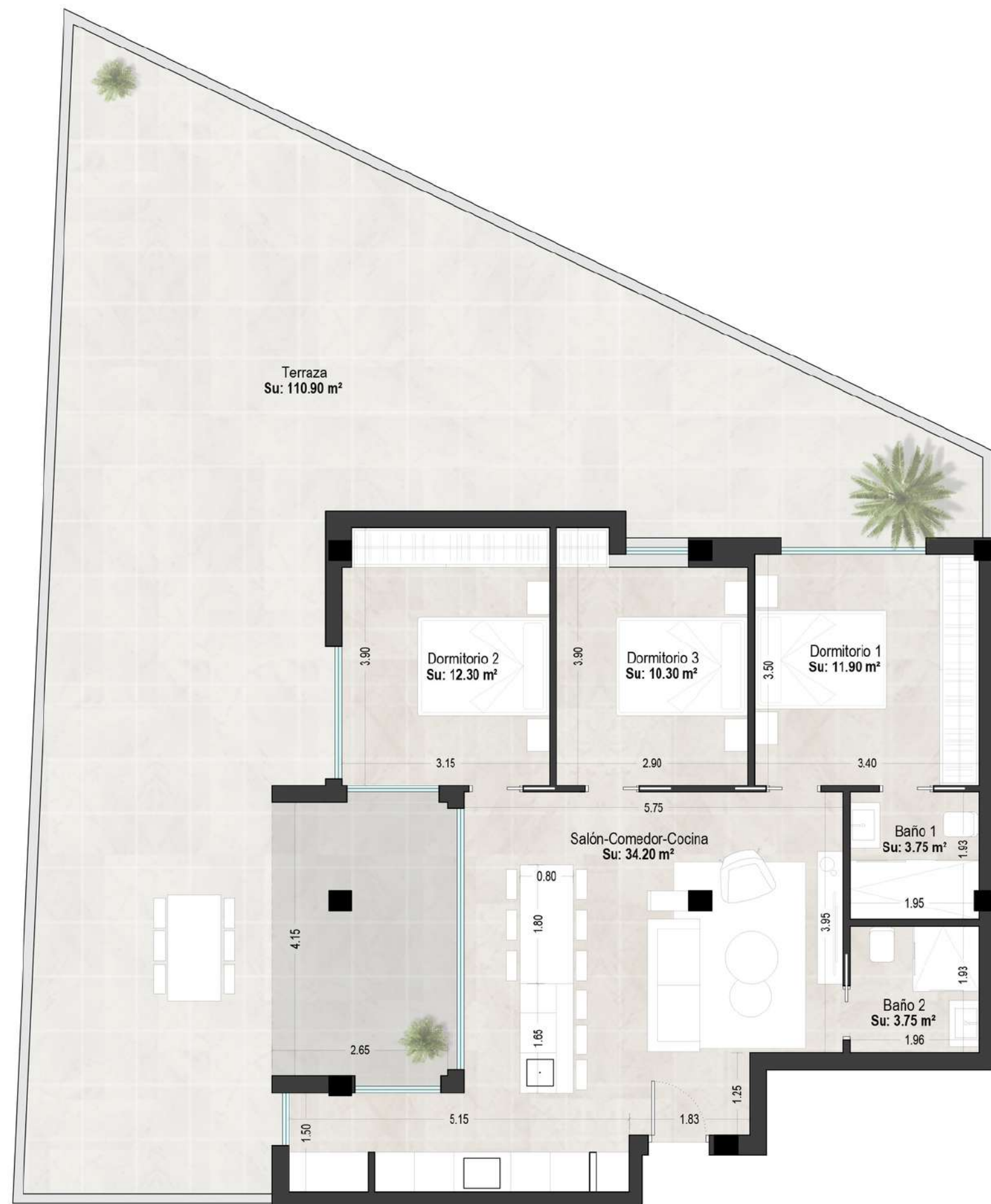
tabla de superficies