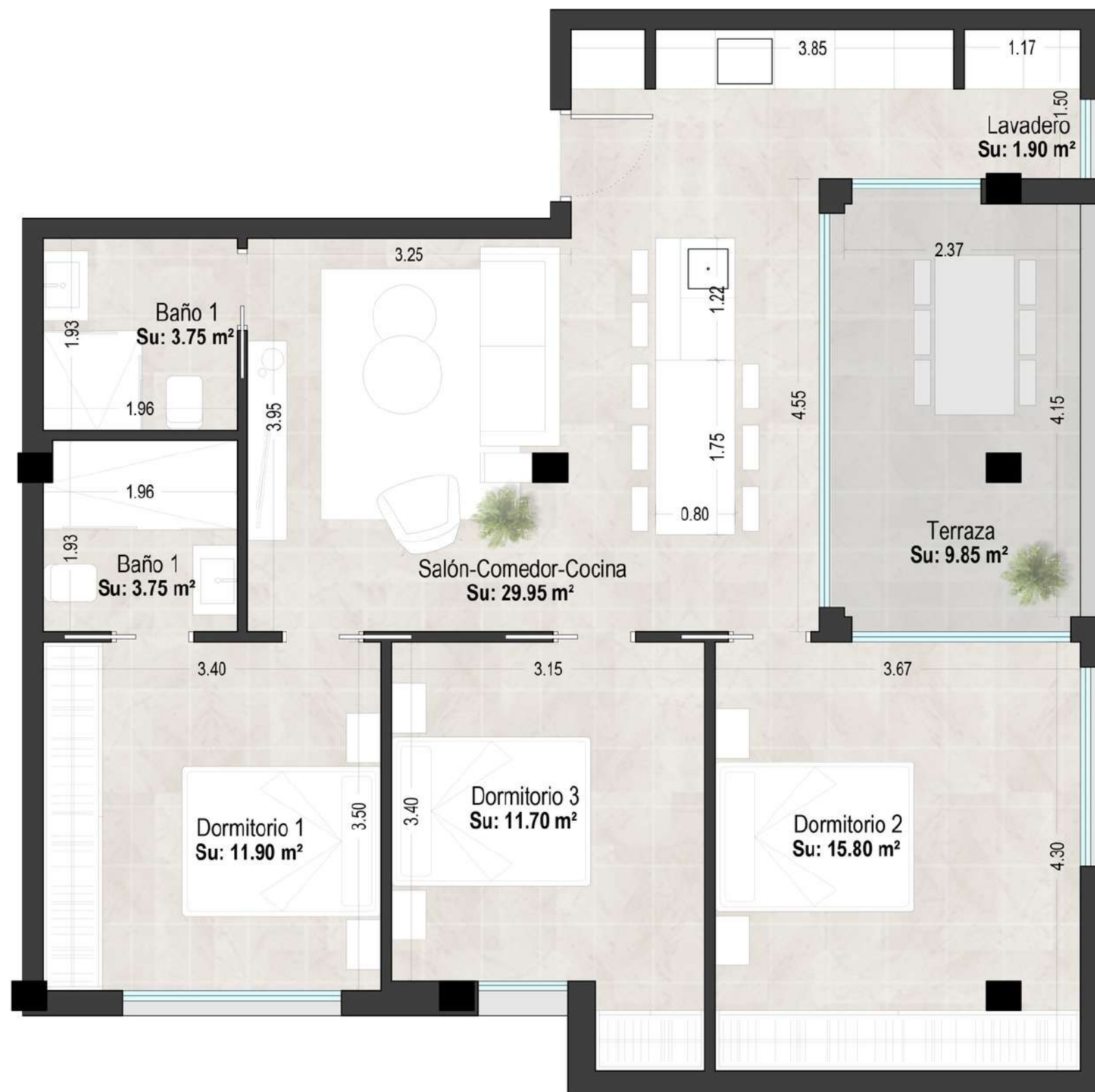
tabla de superficies