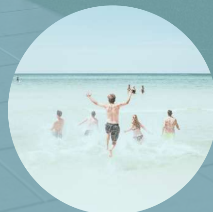
BEACH WALKING DISTANCE