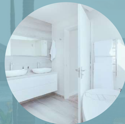
ALL EXTRAS INCLUDED